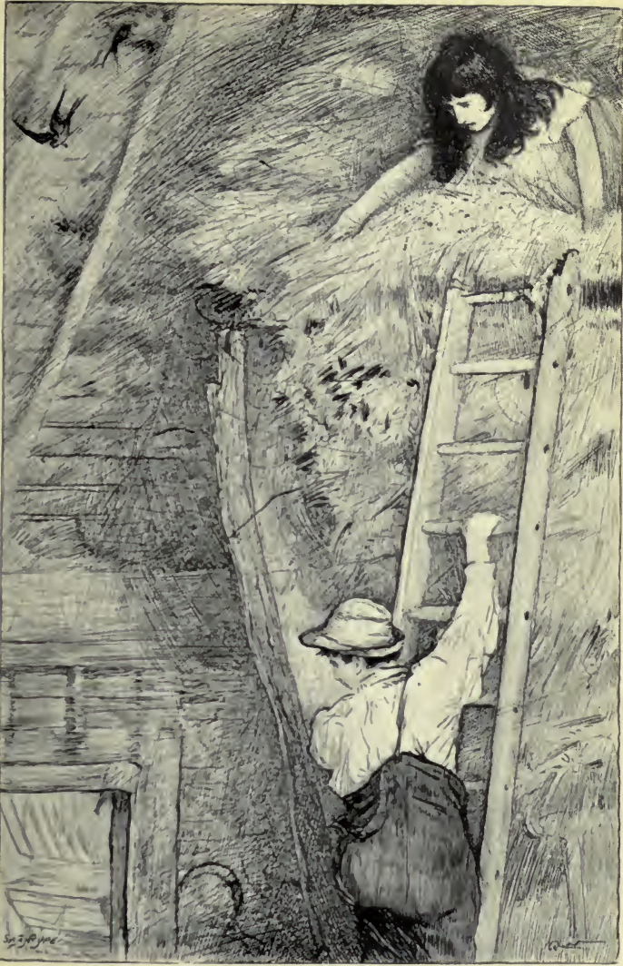
‘She heard Robin hurrying up the ladder.’